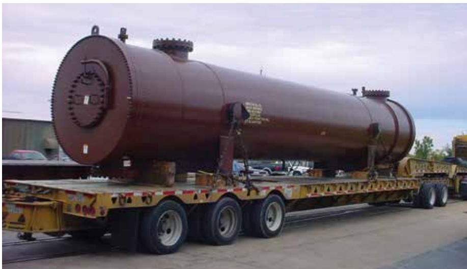
Compressed Gas Cooler

Whether you are looking for plate fin, bimetallic fin tube, or bare tube, TEi's Compressed Gas Coolers offer high-efficiency and long-term availability.